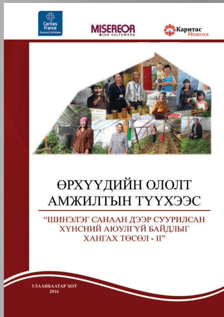
FOOD SECURITY PROJECT BENEFICIARY TESTIMONIES