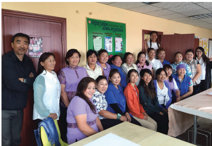
During training with Fu Jen University Professors and students