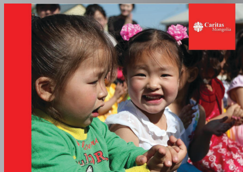
CM ACTIVITY INTRODUCTION LEAFLET