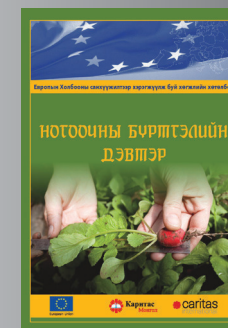
VEGETABLES HARVESTING NOTEBOOK