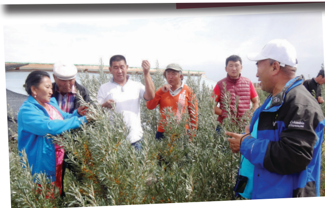
Gobi-Altai province, Biger soum. "Cooperative sharing experiences"