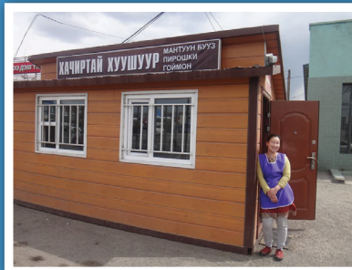
Returnee who was assisted with fast food equipments and rental of food shop.