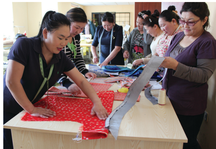
A typical day at STC

This year the FU JEN Catholic University of Taiwan were invited to give an advanced training to our beneficiaries and staff from the contemporary wear. This will help the people to improve their knowledge levels so that they can respond to the new market demands. The 3 STC staff and 23 beneficiaries were empowered through this course.