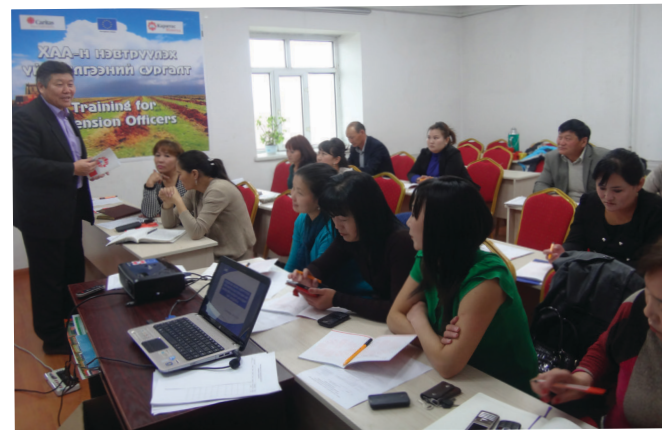
Workshop for extension officers

Due to practical reasons, the CESCO implementation period has been extended until June 30, 2017, in order to achieve some incomplete activities.