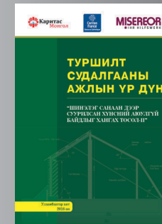
R&D RESULT CONSOLIDATION