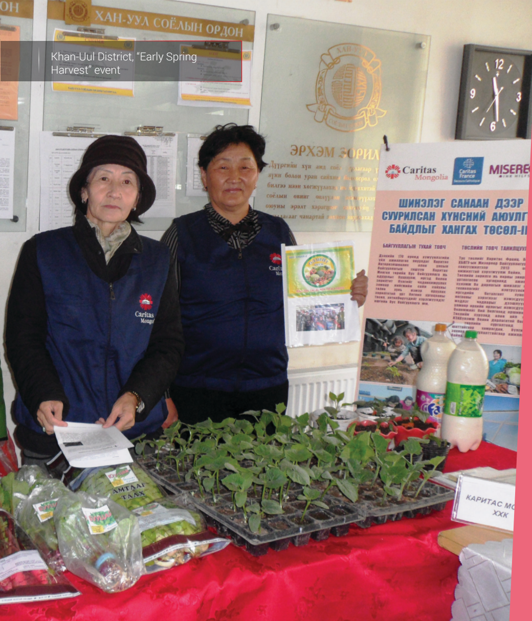
Khan-Uul District, "Early Spring Harvest" event