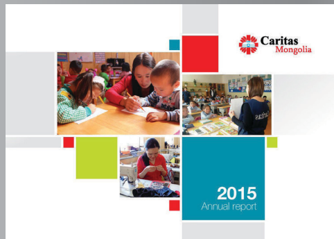
ANNUAL REPORT 2015